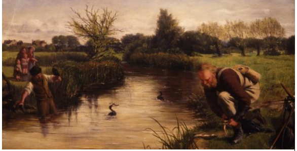
'Fishing by Proxy' by the artist James Clark Hook