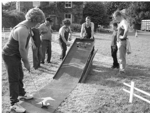
Arncliffe Cross Country Golf 2005, and the final hole of Crazy Golf at the Falcon